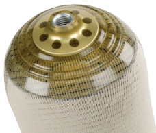
Accordion locking umbrella